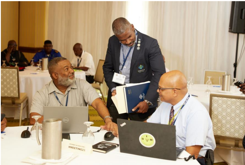
CIP-OAS & BPI Regional Table-Top Exercise, Bridgetown 2023