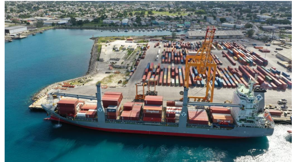
Cargo operations at the Port of Bridgetown, BPI 2025