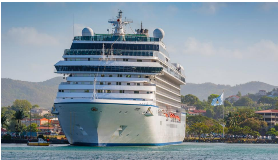
Cruise vessel at the Castries Cruise Port, SLASPA 2025