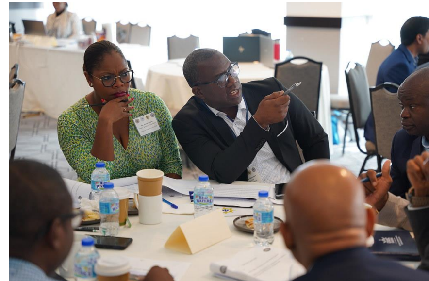
CIP-OAS & PATT Regional Table-Top Exercise, Port of Spain 2024

→ Joint operations strengthen overall critical infrastructure protection and resilience.