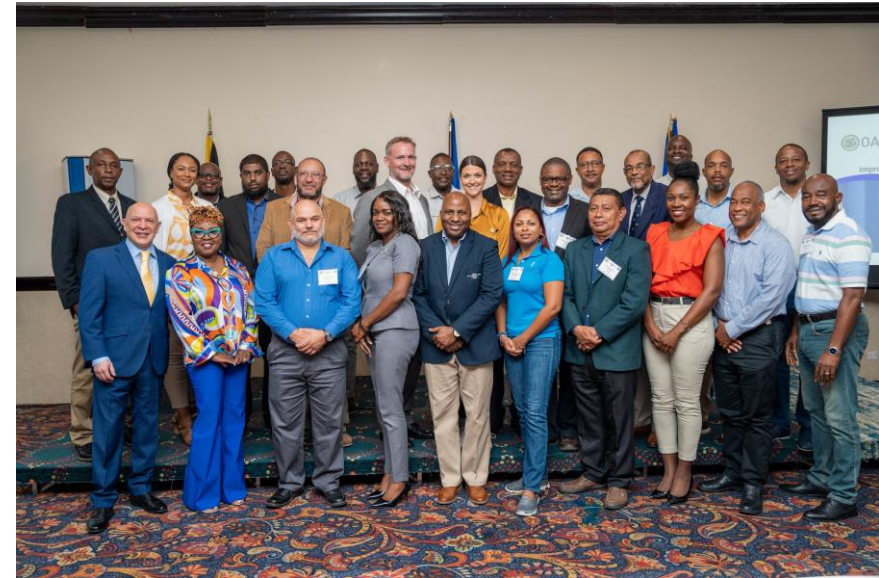
CIP-OAS & PAJ Regional Table-Top Exercise, Kingston 2023

→ Visit www.portalcip.org for Port Resilience resources and documents here