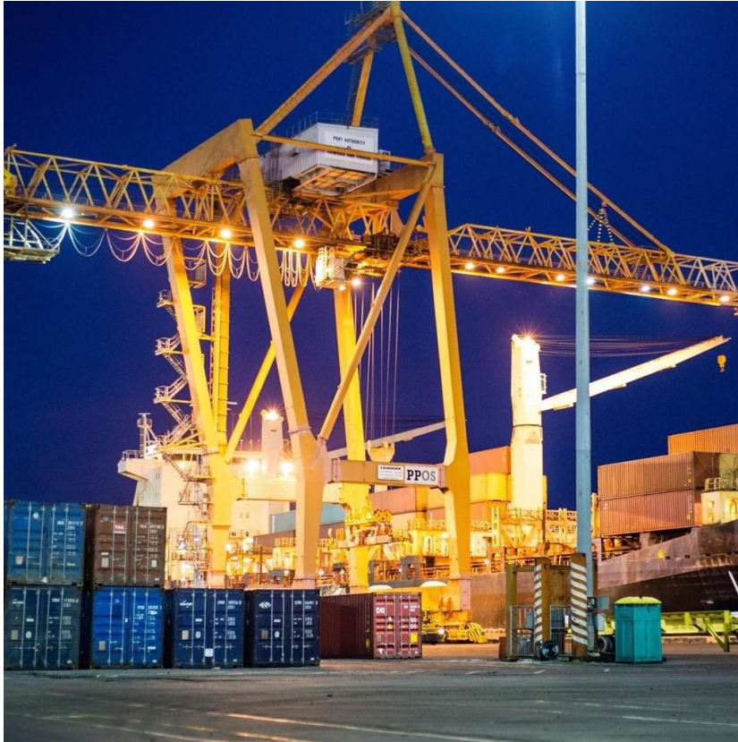
Port of Port of Spain, PATT, 2024