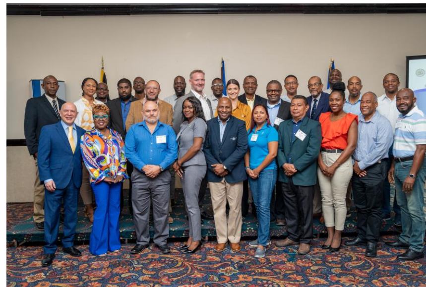
CIP-OAS & PAJ Regional Table-Top Exercise, Kingston 2023